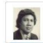
1979 Gatt Magay COLGATE-PALMOLIVE PHILS.