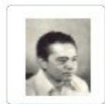
1978 Santiago Olbes CARNATION PHILIPPINES, INC.