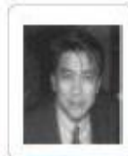
1992 Winston Marbella MAGNOLIA CORP.