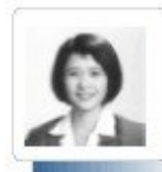
2001 Angelica Suiza GOLDEN ABC, INC.