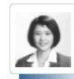
2000 Angelica Suiza GOLDEN ABC, INC.