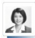
2001 Angelica Suiza GOLDEN ABC, INC.