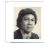
1979 Gatt Magay COLGATE-PALMOLIVE PHILS.