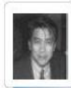
1992 Winston Marbella MAGNOLIA CORP.